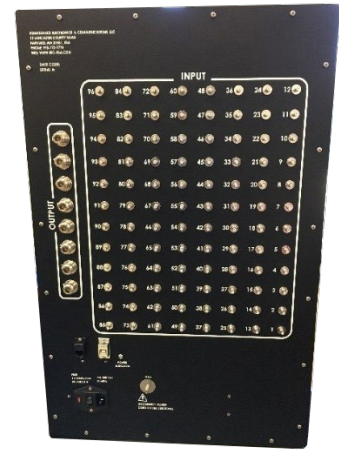
18A6BAF 8 X 96