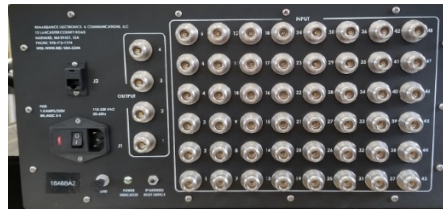
18A6BAZ 4 X 48