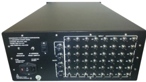
18A6BAC 4 x 48