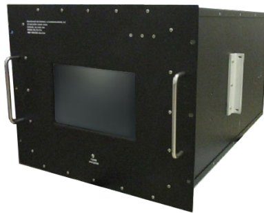
18A6BAY 24 X 12