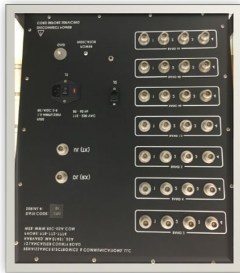
18A6BAX 5G Testing SM