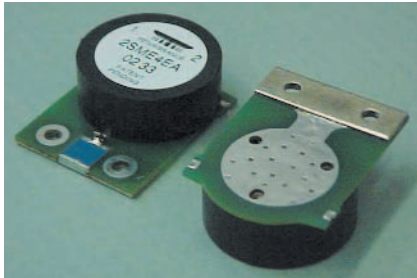
▲ Fig. 2 SM high power isolators showing the mounting surface.

the circulator/isolator housing. The cap is made from an epoxy mould and is sealed to the PCB with a silicone rubber adhesive. After assembling on the user's PCB, the unit becomes environmentally sealed and aqua washable.