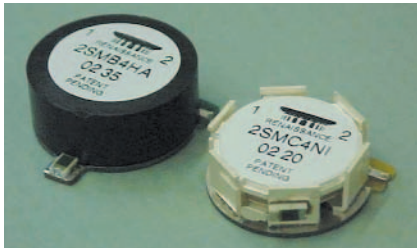
▲ Fig. 1 SM low power isolators.